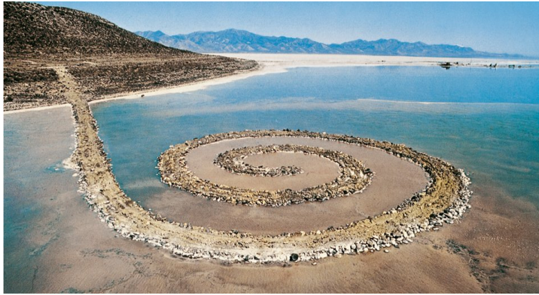
Fig. 1 - Spiral Jetty, Robert Smithson, The Great Salt Lake, Utah ( http://en.wikipedia.org/wiki/Spiral_Jetty )

Because land works are created in nature with unprocessed materials they are ephemeral and this land works will keep in the art history with the help of the recordings and photos.