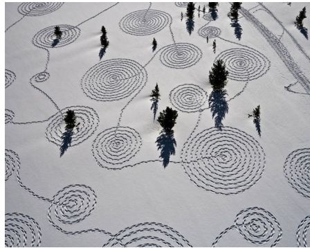
Fig.2 –Snow Drawings, Sonja Hinrichsen ( https://www.google.ro/search Sonja Hinrichsen; https://www.google.ro/search Jim Denevan)

For example Sonja's Hinrichsen land works are so interesting, she used the snow to recreate the dram winter landscape (fig. 2) or Jim's Denevan land art in sand which reworks the beach (fig. 3).