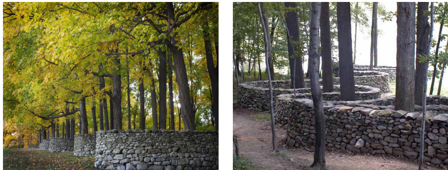
Fig. 8 – The Wall Storm King, Andy Goldsworthy ( http://greenskydesigns.com/art-in-the-landscape-goldsworthys-storm-king-wall )

Besides the ephemeral sculptures in landscape using materials such as sand, seeking timber, snow, leaves, creating all sorts of shapes, Andy Goldsworthy created in 1997 the permanent sculpture /Storm King Wall/ in a modern sculpture park in New York State (fig. 8). The wall is made of a coil-shaped stones found there, 695 meters long, winds among trees, sink into a pond, stands out in the far plane and heading towards a deal without the trees, where it meets a highway. The Art and landscape is completed making from Andy Goldsworthy's work a symbol.