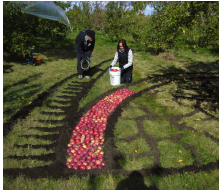
Fig. 5 - Eve IL, Agnes Dumouchel The creative process

In their amazing land sculptures the artists are more intreresting about the creative process even than final result of their works. (fig. 5 and fig. 6).