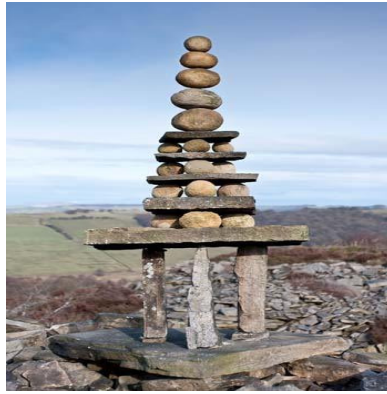
Fig. 7- Richard Schilling ( https://www.google.ro/search?client )

Besides the ephemeral sculptures in landscape using materials such as sand, seeking timber, snow, leaves, creating all sorts of shapes, Andy Goldsworthy created in 1997 the permanent sculpture /Storm King Wall/ in a modern sculpture park in New York State (fig. 8). The wall is made of a coil-shaped stones found there, 695 meters long, winds among trees, sink into a pond, stands out in the far plane and heading towards a deal without the trees, where it meets a highway. The Art and landscape is completed making from Andy Goldsworthy's work a symbol.