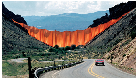
Fig. 10 - Christo and Jeanne-Claude Valley Curtain, Rifle, Colorado

Therefore natural materials, the special places of location, the creative process are important elements in land art creations through which is achieved a stunning landscape harmony. “We appreciate the natural objects in terms of the work of art, which means that we embellish the nature” (Zaharia, 2007).