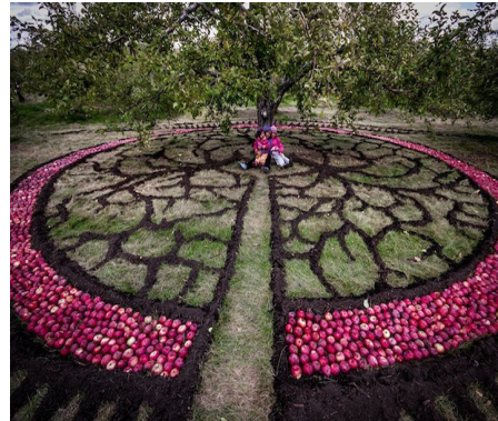
Fig. 6 - Eve IL, Agnes Dumouchel. The final work