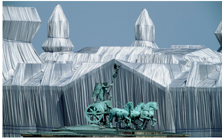
Fig. 9 - Christo and Jeanne-Claude Reichstag packed ( https://www.google.ro/search?q=christo si jeanne-claude )